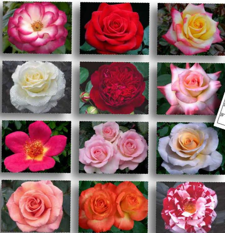
Falling in Love - What a great name for this rose because everyone who sees it falls in love with it. Its form - to few words, light pink (with a white center) blooms have 35 to 40 petals and exhibition form. The large, full-grown, semi-glossy foliage only enhances its beauty. And if all of that was not enough to make you love this rose, it also has award-winning fragrance.